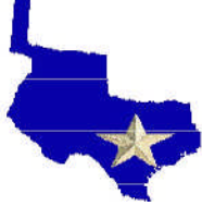
Geographical and Jurisdictional Boundaries