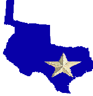
Geographical and Jurisdictional Boundaries